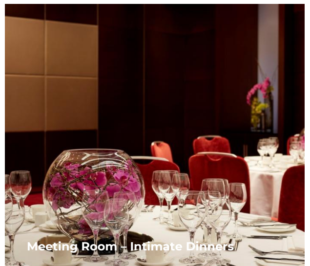
Meeting Room - Intimate Dinners