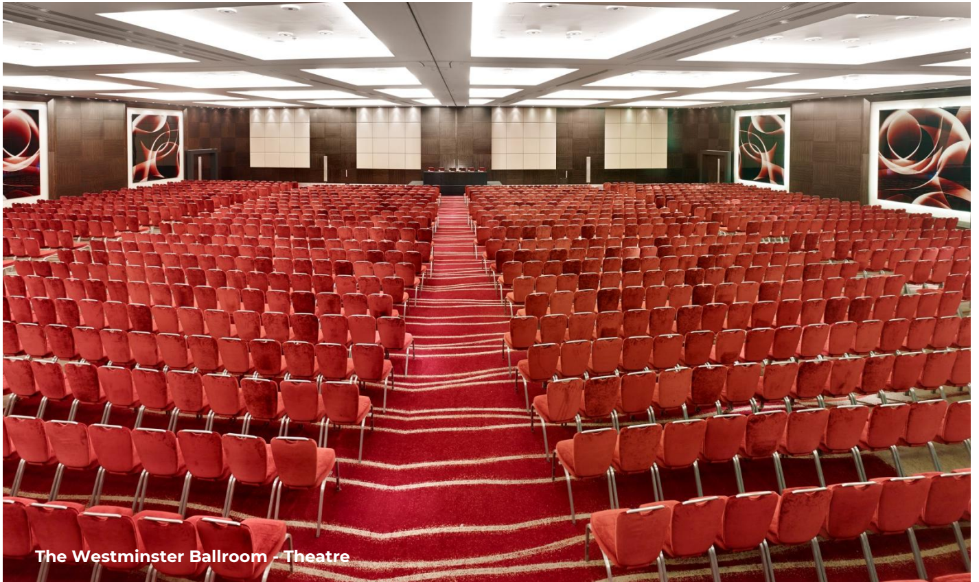
The Westminster Ballroom - Theatre