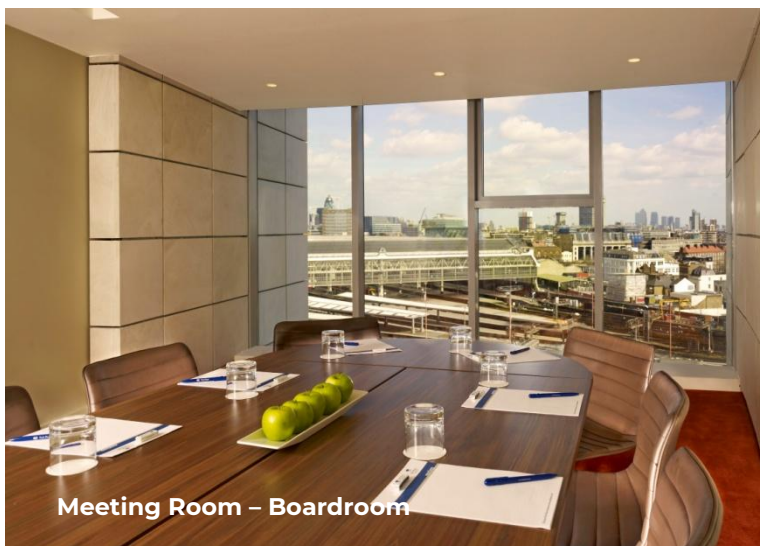
Meeting Room - Boardroom